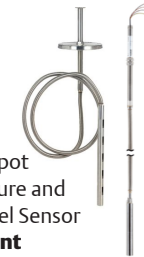
Multiple Spot Temperature and Water Level Sensor Rosemount 565/566/765