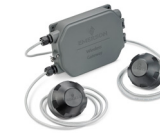
Emerson Wireless 1410S Gateway