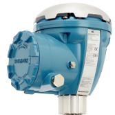
Radar Level Gauge Rosemount 5900S (with 2-in-1 option)