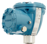
Radar Level Gauge Rosemount 5900C